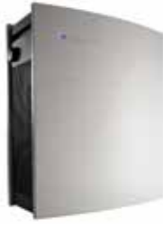
Blueair 403 Rooms up to 365 sq. ft. 457-0402 $549.00