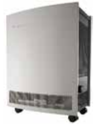
Blueair 603 Rooms up to 698 sq. ft. 457-0601 $769.00

Austin Airs provide 4 stages of intense filtration. What sets the HealthMate apart from other True HEPA systems is its filters. The HealthMates contain 30-60 square feet of True Medical-Grade HEPA filter media. The HEPA is surrounded by tightly by carbon monoxide. The specially made activated carbon is highly porous, producing a larger surface area that extends its performance. Two pre-filters block larger particles – one that surrounds the carbon/zeolite filter, the other that wraps around the interior of the unit's housing. Available in Black, White, Silver, Sandstone and Midnight Blue.