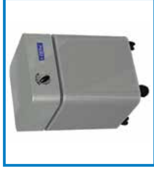
Advanced HEPA+ Air Purifier shown in five colors on page 12