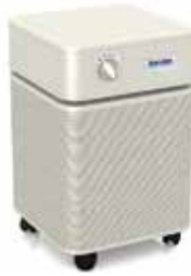
Austin Air HealthMate HM400 100-HM-AUSHM $538.99