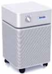
Austin Air HealthMate Jr HM200 100-HMJ-AUSHMJR $374.99

Austin Airs provide 4 stages of intense filtration. What sets the HealthMate apart from other True HEPA systems is its filters. The HealthMates contain 30-60 square feet of True Medical-Grade HEPA filter media. The HEPA is surrounded by tightly by carbon monoxide. The specially made activated carbon is highly porous, producing a larger surface area that extends its performance. Two pre-filters block larger particles – one that surrounds the carbon/zeolite filter, the other that wraps around the interior of the unit's housing. Available in Black, White, Silver, Sandstone and Midnight Blue.