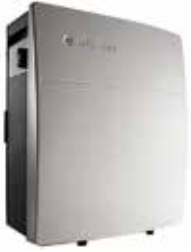
Blueair 203 Rooms up to 240 sq. ft. 457-0201 $329.00