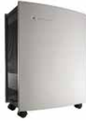
Blueair 503 Rooms up to 580 sq. ft. 457-0501 $659.00