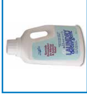
AllerTech® Laundry Detergent shown on page 18