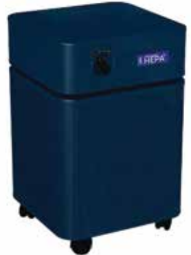
712-3206 Midnight Blue