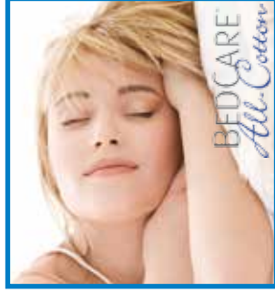
BedCare All-Cotton Allergen Encasings shown on page 4

Trusted by doctors for more than 40 years.