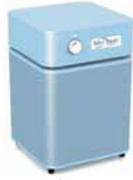
Austin Air Baby's Breath HM205 100-3006 $394.99 *Also available in pink